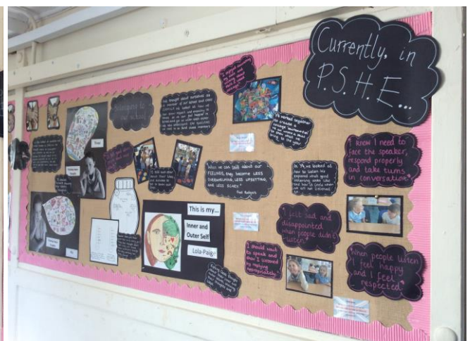
Subject specific displays show current learning throughout the school.