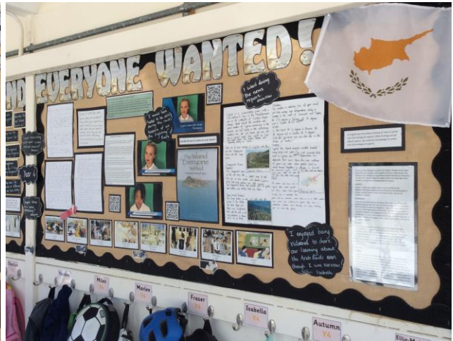
A wide variety of student's work, photographs, and the process of learning within the unit is evident on the display. Displays may use some interactive elements.