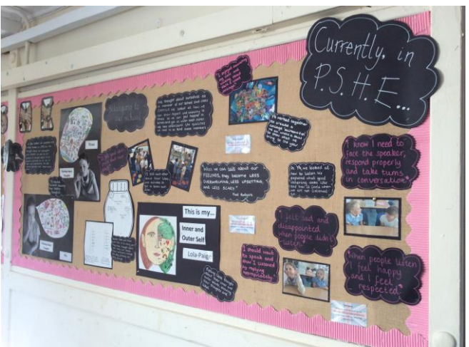
Subject specific displays show current learning throughout the school.